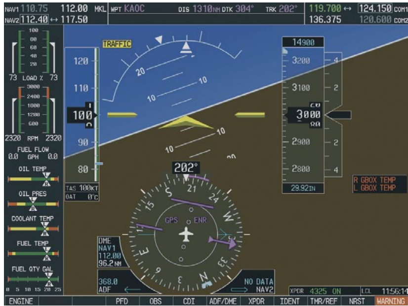
Figure 3 Reversionary Mode