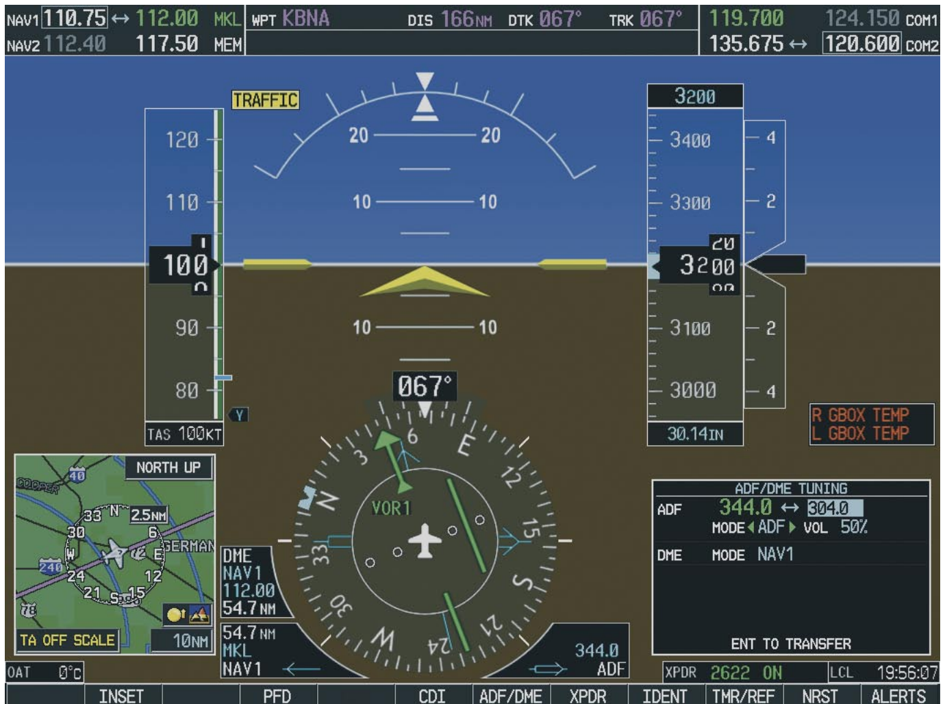
Figure 2 GDU 1040 (PFD Shown)

Both GDU 1040 displays are identical in hardware. The aircraft wiring harness determines whether the display functions as a PFD or an MFD (see Figure 2). A configuration module within the PFD connector contains aircraft-specific backup configuration data.